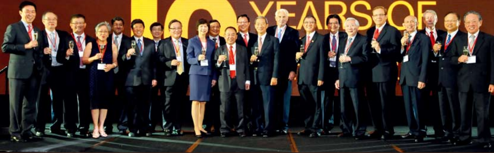
Toasting to strong partnerships at Keppel O&M's 10th Anniversary Party in Houston were the Board of Directors and senior management of Keppel Corporation and Keppel O&M