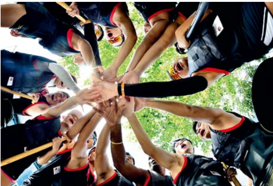
Keppel Dragons all set to row at the DBS Marina Regatta

Close to 100 international and local teams participated in this event. After a hard-fought race, the Keppel Dragons men's team clinched second place in the inter-corporate open category.