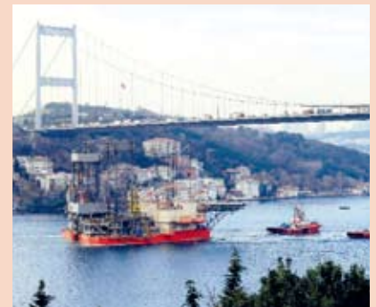
The first KFELS B Class rig for Ukraine, Piter Godovanets, had its legs cut off to pass under the Bosphorus Bridge before being reassembled

Godovanets was a unique project where the upper sections of the legs had to be cut down from 517 feet to 221 feet and the upper part of the derrick dismantled. This was because the only route to the Black Sea was through the Bosphorus Straits and under the famous Bosphorus Bridge which has a clearance of 210 feet from the water level. In order to clear the bridge, the rig was unloaded from the dry tow vessel and had its legs lowered down into the water.