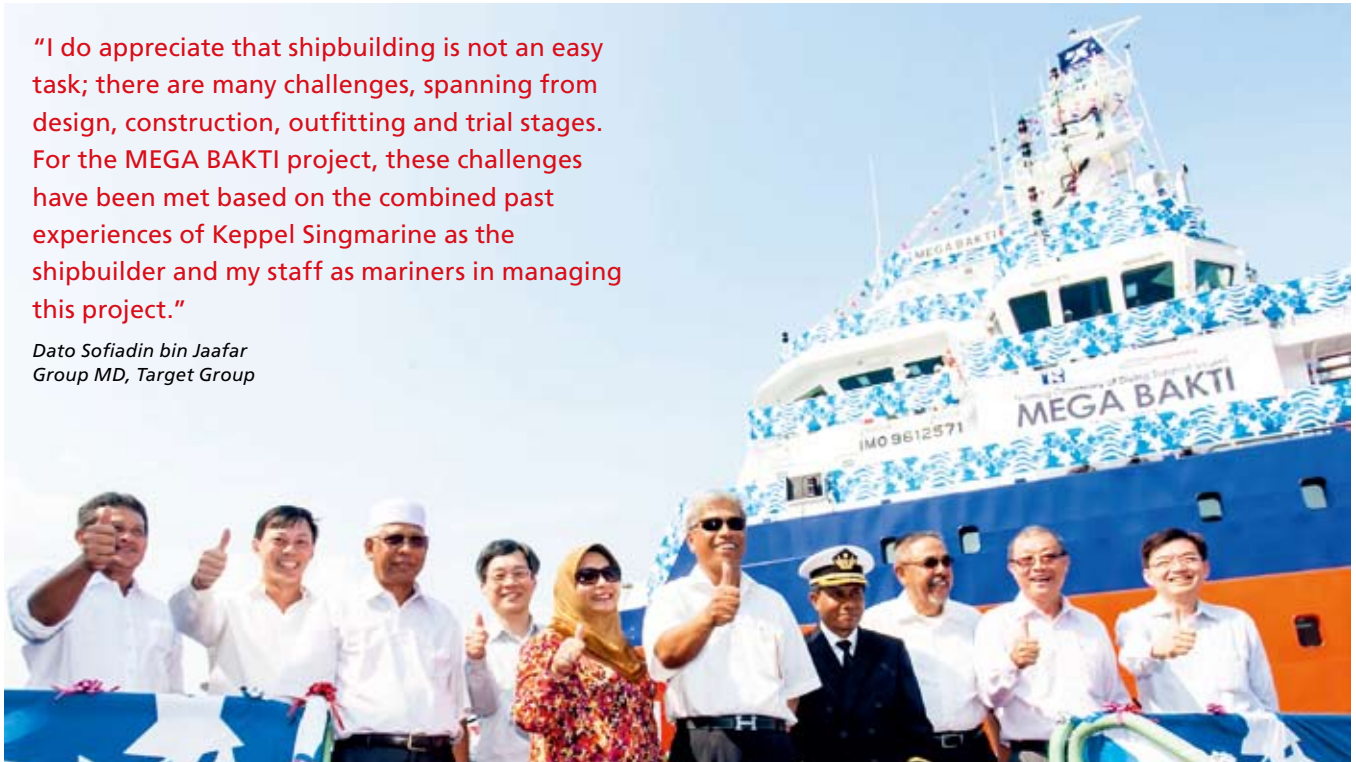
Keppel Singmarine and Target Resources celebrate the successful completion of the dive support vessel MEGA BAKTI