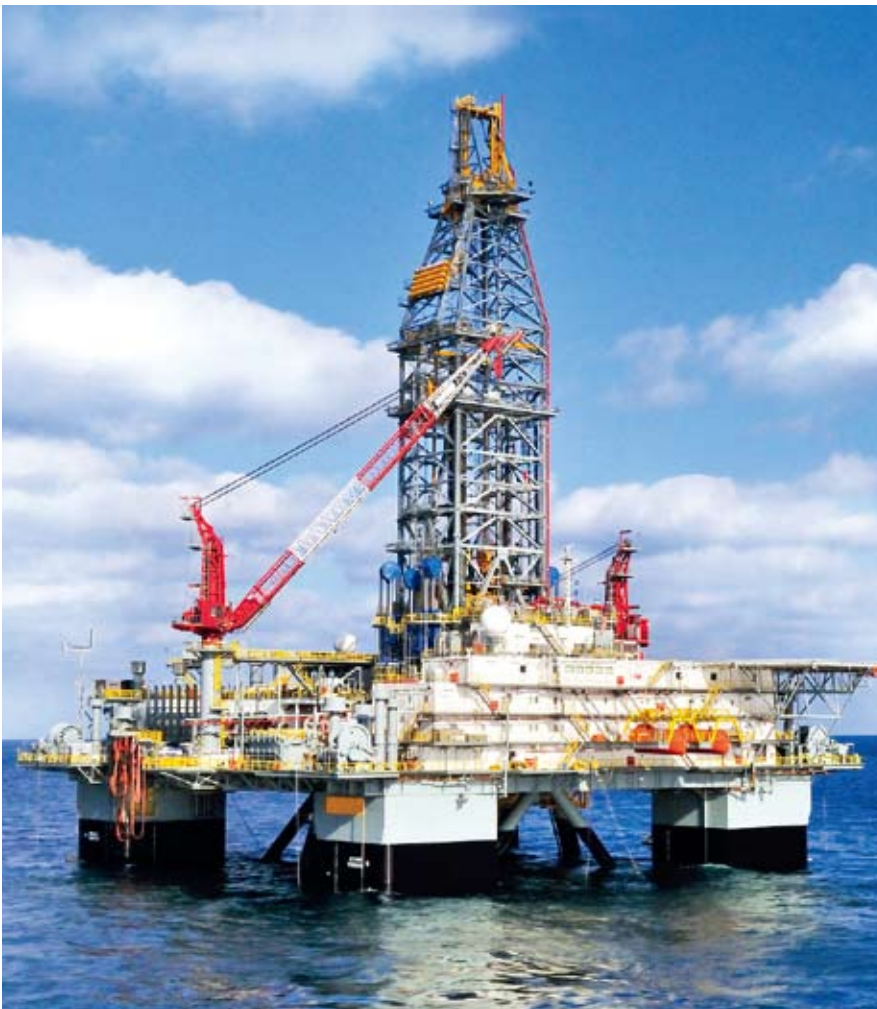
Keppel FELS has built seven ENSCO 8500 Series® ultra-deepwater semisubmersibles for Ensco, worth about US$3.5 billion in total

Apart from the three KFELS Super A Class jackup rigs, Ensco currently has a drillship, ENSCO DS-6, which is being modified at Keppel FELS. The three jackup rigs under construction, provide increased drilling efficiencies for multi-well platform programmes, ultra-deep gas drilling, and ultra-long reach wells of up to 40,000 feet drilling depth. The first jackup scheduled to be delivered, ENSCO 120, is already contracted for work in the Central North Sea.