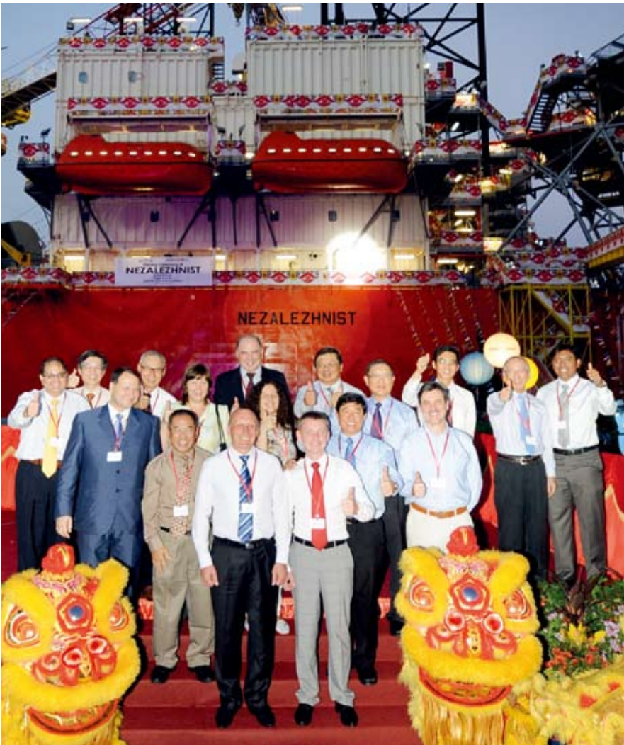
Keppel, Chernomonaftogaz and Naftogaz celebrating the naming of Ukraine's second KFELS B Class jackup rig, NEZALEZHNIIST, at Keppel FELS

The 34th KFELS B Class jackup rig NEZALEZHNIIST, which means independence in Ukrainian was named at Keppel FELS on 20 June 2012. The rig represents the country's aspirations to be energy self-sufficient.