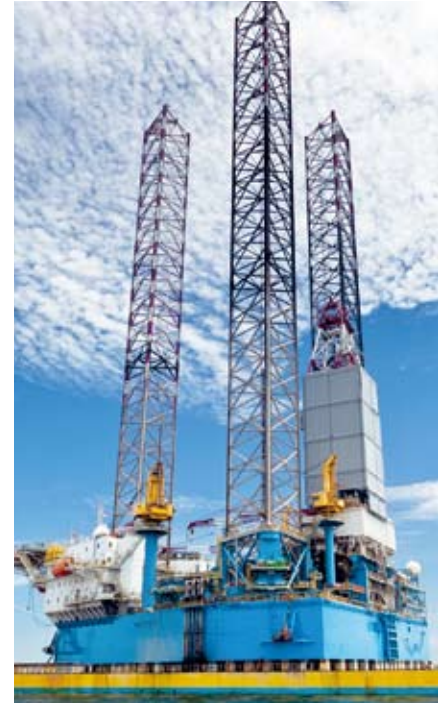
Hakuryu 10 was delivered three days ahead of schedule

In addition to the record orders for newbuild rigs at Keppel FELS, the yard has recently secured a variety of repair and modification projects including EnSCO's DS-6 drillship, Japan Drilling Company's (JDC) Hakuryu 10, Alaska Industrial Development and Export Authority's (AIDEA) Endeavor – Spirit of Independence, Seadrill's West Callisto and PetroVietnam Drilling's PVD I.