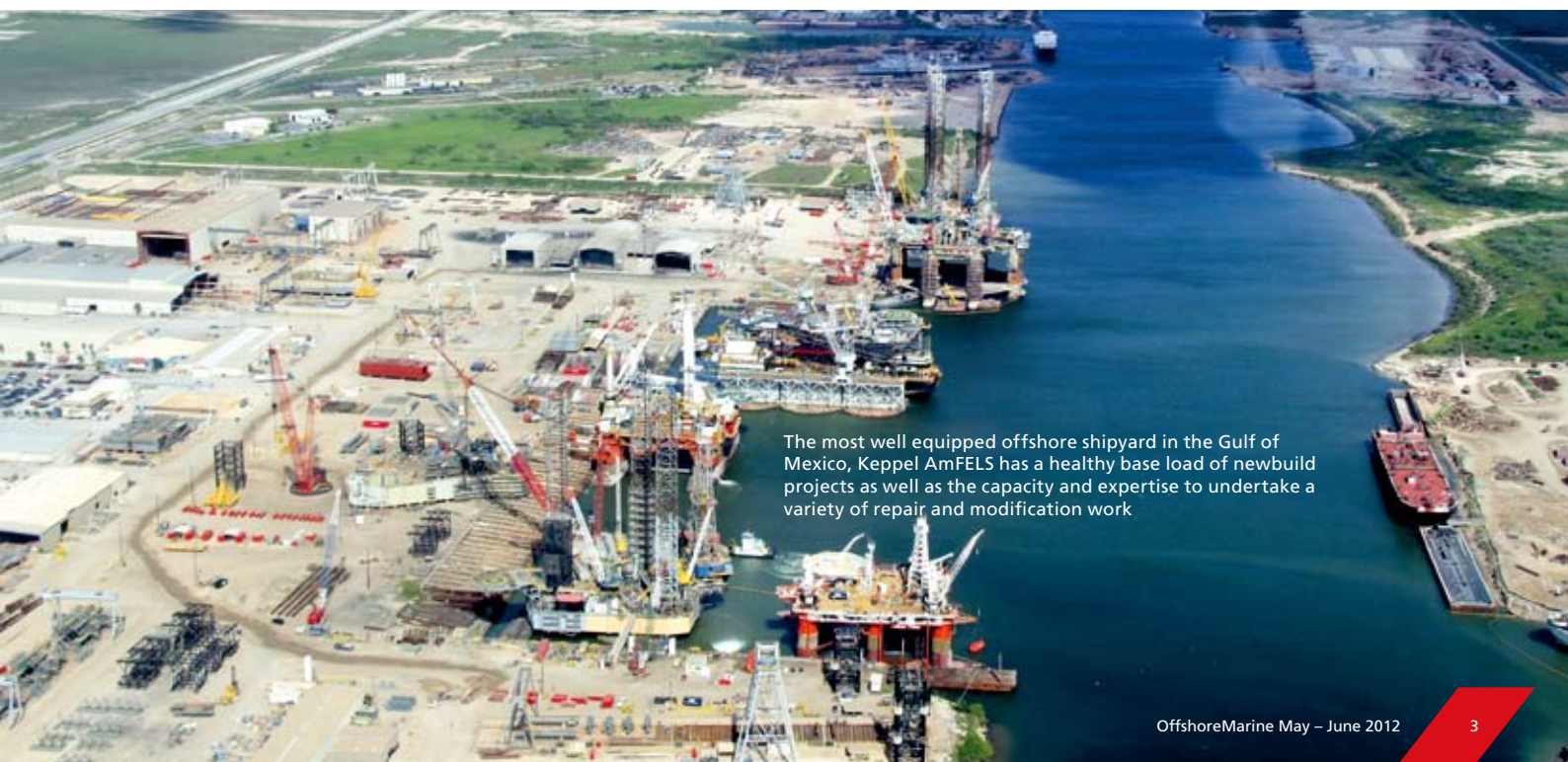
The most well equipped offshore shipyard in the Gulf of Mexico, Keppel AmFELS has a healthy base load of newbuild projects as well as the capacity and expertise to undertake a variety of repair and modification work

CSC's scope of work includes steelworks construction and fabrication of the hull structure while BSC will provide overall project management. This arrangement will expedite the construction of the floating dock and demonstrates the synergy of Keppel O&M's shipyards.