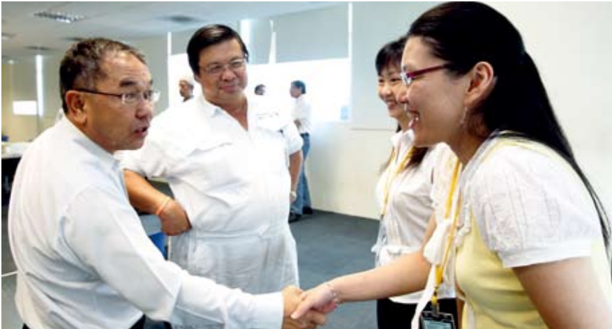
The Global Management Programme hones the strategic thinking and management skills of younger talent

end. Induction programmes and guidance from more experienced colleagues help orientate new recruits into their roles. As part of the Keppel Group Orientation, recruits also have the opportunity to visit the other businesses in the Keppel Group.