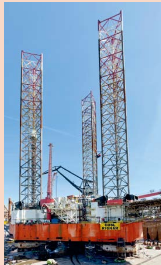
Keppel Verolme received an early delivery bonus for delivering COSL Rigmar five days ahead of schedule

A full commissioning programme was completed prior to the rig's departure.