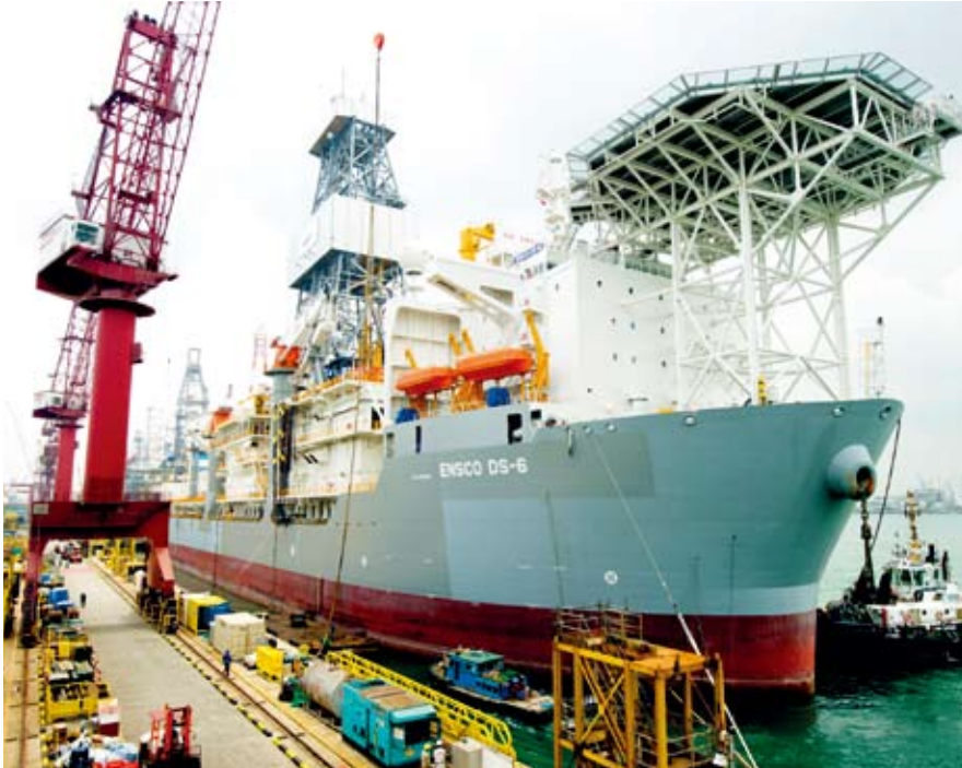
EnSCO DS-6 is undergoing modification and upgrades to meet BP's latest enhanced voluntary drilling standards