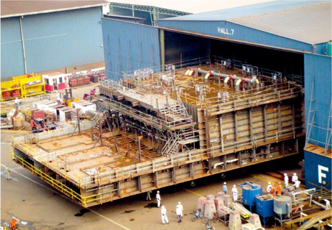
Painting operations carried out during the block assembly stage of rigbuilding has been identified for improvements

With 30 newbuild rigs on order as of June 2012, Keppel FELS has to ensure high levels of productivity for the safe, on time and within budget execution of its projects. Through innovation and adoption of industry best practices, the yard continues to improve its production processes.