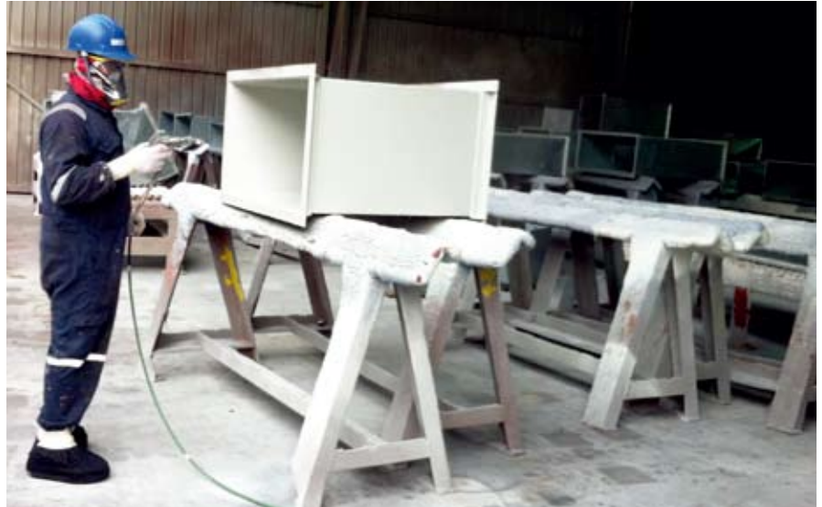
The manual application of paint involves workers spraying paint onto the surfaces of the blocks by moving the nozzles in a pattern

The results show that the new systems designed by KOMtech not only reduce paint wastage by 20% but also require less manpower to complete a similar hull painting job. With more automation, Keppel FELS enjoys augmented productivity and cost savings.