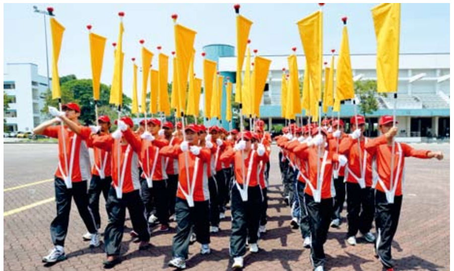
The Keppel contingent training hard for National Day Parade 2012

"A common characteristic of Keppelites is the Can-Do! spirit – this shows up in how Keppelites young and old are doing their best to march in sync and put up a good show at NDP 2012."