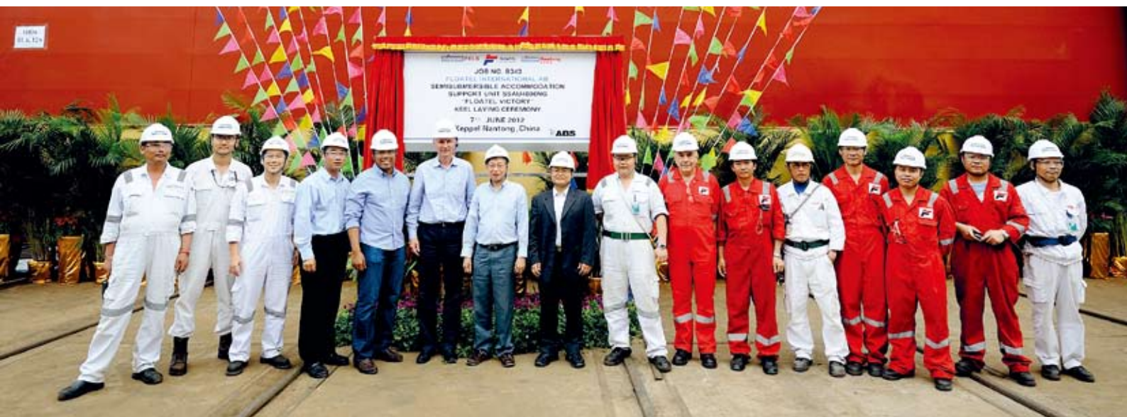
Floatel and Keppel FELS celebrated the keel-laying of Floatel Victory on 7 June 2012 at Keppel Nantong

Keppel Singmarine also celebrated the launching of H355, a 50-tonne tugboat, on 21 May 2012. Developed by Keppel O&M's Marine Technology Development, H355 is the first tugboat built by Keppel Singmarine for its Indonesia customer PT Humpuss.