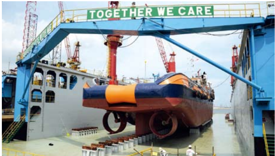
Keppel Shipyard's new Floating Dock 3 measures 170 m by 26 m and has a lifting capacity of 12,000 tonnes

Over in Azerbaijan, Keppel O&M deepened its presence in the Caspian Sea region with the