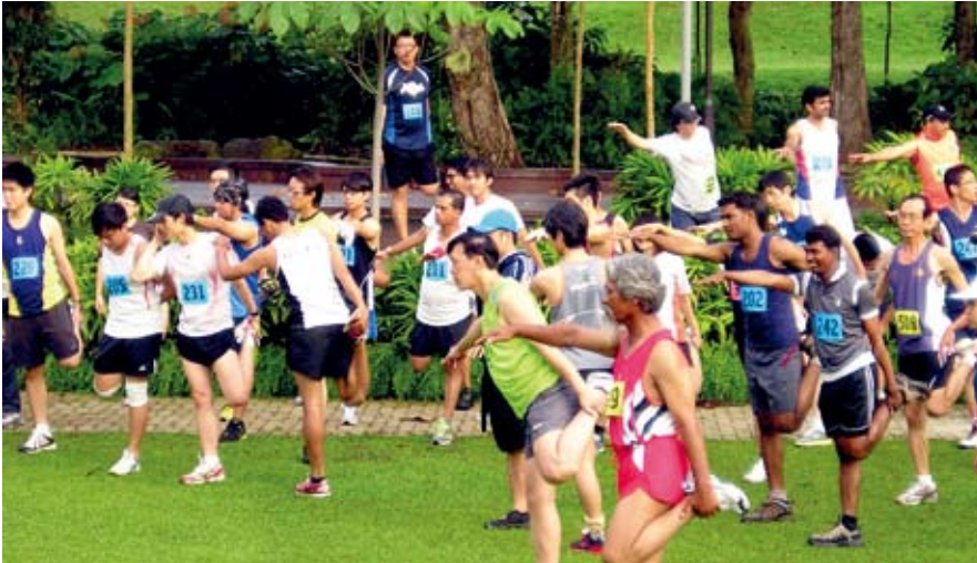
Runners stretching their muscles in preparation for the 4.8km race through MacRitchie Reservoir Park

3.2km to 4.8km, depending on the race category.