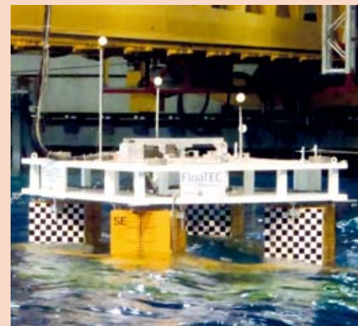
KOMtech, Keppel's Deepwater Technology Group and FloaTEC have successfully conducted the Extendable Draft Semisubmersible (EDS) and Deep Draft Semisubmersible (DDS) model tests

EDS and DDS are both cost-effective, ultra-deepwater, dry tree drilling and production system. These two designs can operate in water depth of 2,200 metres in the Santos Basin, offshore Southern Brazil.