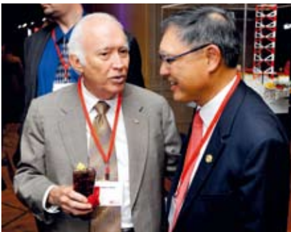
Mr Solomon P. Ortiz with Mr Choo Chiau Beng, Chairman of Keppel O&M

Keppel Offshore & Marine celebrates 10 years of growth and excellence this year. A big part of its success is due to the strong partnerships and friendships built up with customers, associates, suppliers, government officials and community leaders. In this feature, we showcase some of Keppel's special relationships.