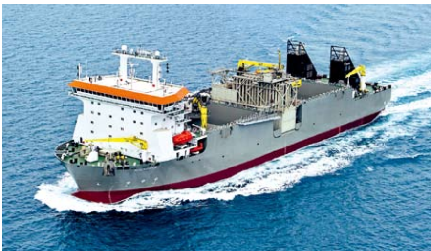
Built by Keppel Singmarine for Royal Boskalis, the rock dumping vessel ROCKPIPER is capable of depositing rocks accurately at water depths of more than 1,000m