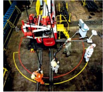
A semi-automated pipeshop at Keppel FELS significantly increases productivity and quality assurance in pipe fabrication

"Furthermore, I can feel that the people are truly passionate about continuous improvement. They are motivated and proud of what