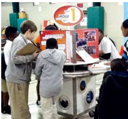
Children learnt more about oil and gas at the Mobile Oilfield Learning Unit exhibit sponsored by Keppel AmFELS

Doing their part to educate children on the technologies and sciences involved in the oil and gas industry, Keppel AmFELS sponsored a travelling exhibition at the Children's Museum and the Harmony Science Academy in Brownsville, Texas, on 12 May and 14 May 2012 respectively.