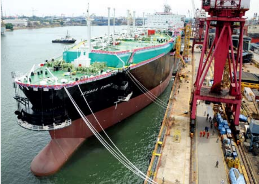
Converted to a Floating Storage Unit (FSU) from a liquefied natural gas (LNG) carrier, FSU Tenaga Empat has been delivered by Keppel Shipyard to MISC Berhad

Keppel Shipyard handles eight to 12 Floating Production Storage and Offloading (FPSO), Floating Production and Storage (FSO) and Floating Storage and Re-gasification Unit (FSRU) conversion and upgrading projects at any one time. Committed to safe, prompt and quality deliveries, it continues to be the industry's preferred partner for such projects.